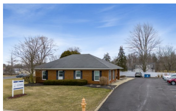
Office - Sold 5/2024