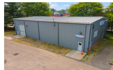
Warehouse – Sold 5/2024