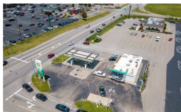
Retail – Sold 5/2024