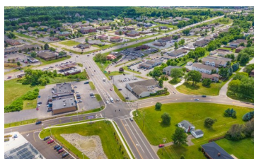
Land - Sold 5/2024