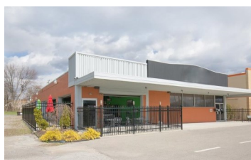
Restaurant - Sold 5/2024