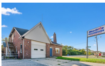
Office - Sold 5/2024