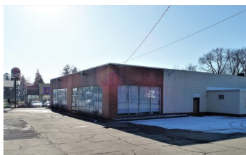
Auto - Sold 5/2024